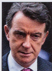
Lord Peter Mandelson

WRONG THEN . . . Some leading business figures and politicians claim the EU is vital to our prosperity. The same people told us we had to join the Euro or go bust. Thank goodness we didn't listen to them . . . WRONG NOW