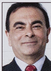
Nissan CEO - Carlos Ghosn

Nick Clegg 2011 "Joining the euro would have been a huge, huge error."