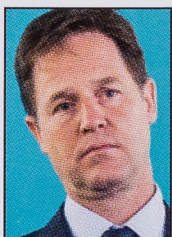
Nick Clegg MP

FACT: since then UK businesses have grown at a faster rate.