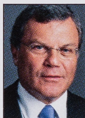
Sir Martin Sorrell – CEO of WPP

"Scotland would successfully flourish if the country cut its ties with sterling and embraced the European single currency."