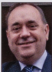
Alex Salmond MP

"Business Leaders appreciate the success of the Euro over its first decade. It has defied the doomsayers who predicted failure."