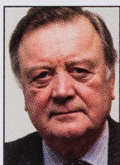
Ken Clarke MP

FACT: since then, unemployment in Europe has soared.