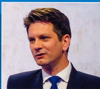
Steve Baker MP appearing on the Sunday Politics on 7 June