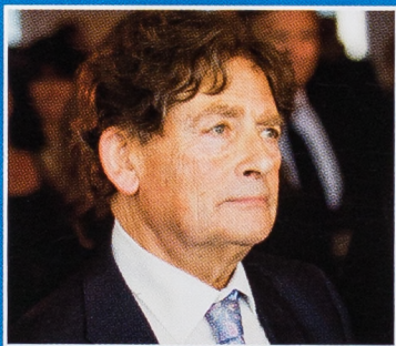
Lord Lawson, President of Conservatives for Britain