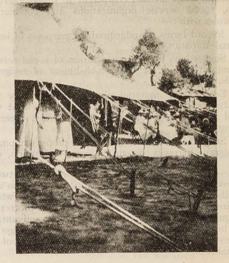
Not only does the little house serve as a club, it is also a hostel where women workers (including two blind masseuses) live and to which they come for holidays and to recuperate after illnesses. It is small wonder that the tents, lent originally by Government for the "Save the Children" garden fete, have been left standing to shelter some of the many applicants for bedrooms in the hostel.

The present home of the Y.W.C.A. is as old world as its garden. The flagged court, the ancient stone walls and the outside staircase take one back many years. It is difficult to imagine it a club centre for women of leisure, for nurses, teachers, students, stenographers, business women; a common meeting ground for women of every race and creed, the place where they come together for study, for recreation and the deepening of their spiritual life.