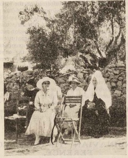
The spirit in the Jerusalem Y.W.C.A. is as international as its membership. The olives leaning over the old wall shade six of the gardenful of guests who sent through the Association such a generous contribution to the "Save the Children" Fund.