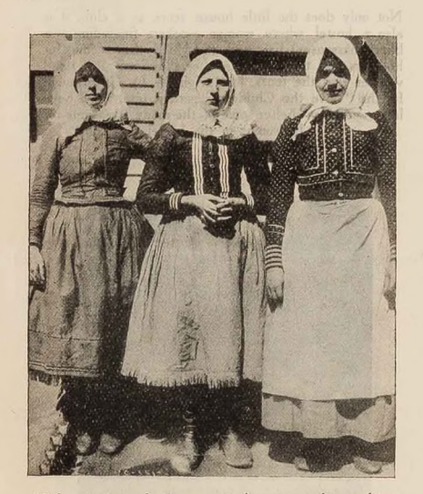
Girl emigrants who have never been more than a short journey, have never seen the sea or been in a large town

III.—Official co-operation shall be effected between the Government Bureau concerned with emigration and with those international voluntary organizations which are directly concerning themselves with the protection and guidance of migrants in order that advantage may be taken of the experience and knowledge of workers who are closely in touch with migrants of all nationalities.