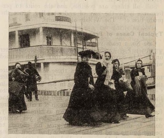
Immigrants landing. Although in some cases they have been medically examined before sailing, they may yet be rejected and sent back to the country in which they no longer have a home.

I.-It is recommended that the International Labour Bureau establish a permanent Commission to visit the ports, frontier stations and railway junctions (the interior points where emigrants gather to procure passports and visas) in order (1) to study the need for international action on the subject of migration; (2) to