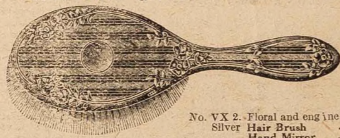
No. VX 2. Floral and engine turned—Silver Hair Brush .. 26/9 " Hand Mirror .. 35/6 " Velvet Brush .. 14/3 " Cloth .. 14/9 Silver-mounted Comb .. 9/6 If floral border without engine turning— Silver Hair Brush .. 22/6 " Hand Mirror .. 29/6 " Velvet Brush .. 12/9 " Cloth .. 13/6 Silver-mounted Comb .. 7/6