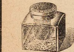
No. VX 4. Silver and Enamelled Ink Bottle, in three sizes 7/6 12/9 16/9