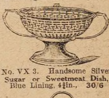
No. VX 3. Handsome Silver Sugar or Sweetmeat Dish. Blue Lining, 4 1/2 in., 30/6