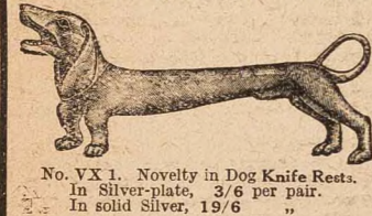
No. VX 1. Novelty in Dog Knife Reels. In Silver-plate, 3/6 per pair. In solid Silver, 19/6

Some examples are quoted here. Write to-day for Special Catalogue.