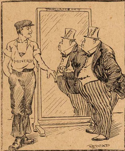
YES, BUT SURELY THIS CHAP IS IMPARTIAL.

The Red Trade Union International was formed because of the failure of the Second and Amsterdam Internationals to help Russia after the workers' revolution. The present circumstances have forced the workers to realise that there are