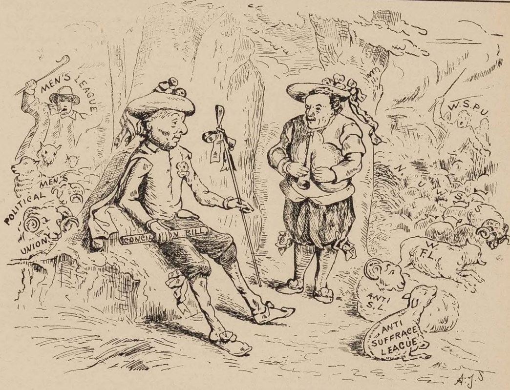
Don Quixote and Sancho as Shepherds.

"Heaven defend me!" quoth Don Quixote, "what a life shall we lead!"