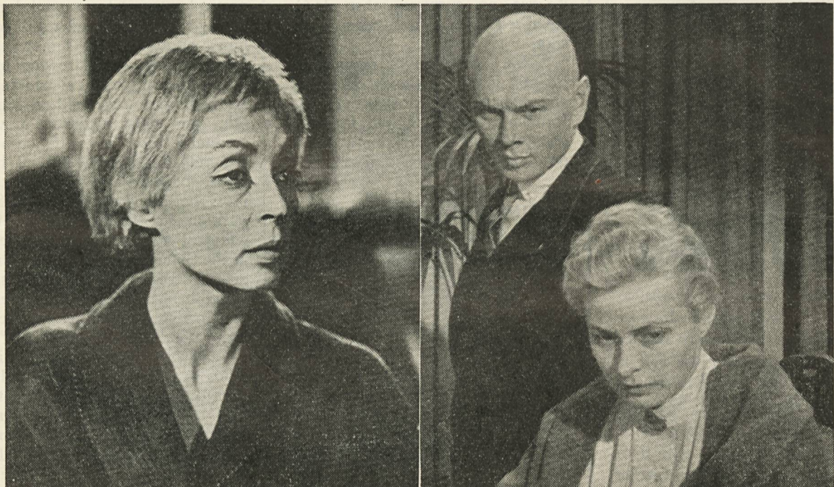
1. The Unknown (Lilli Palmer) as she appears in the last scene of Gala Film's "Is Anna Anderson Anastasia?"