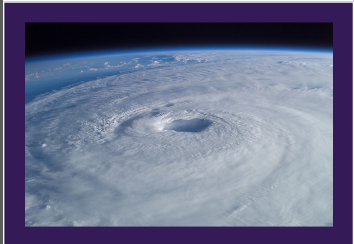
Compound Risks and Sustainable Security