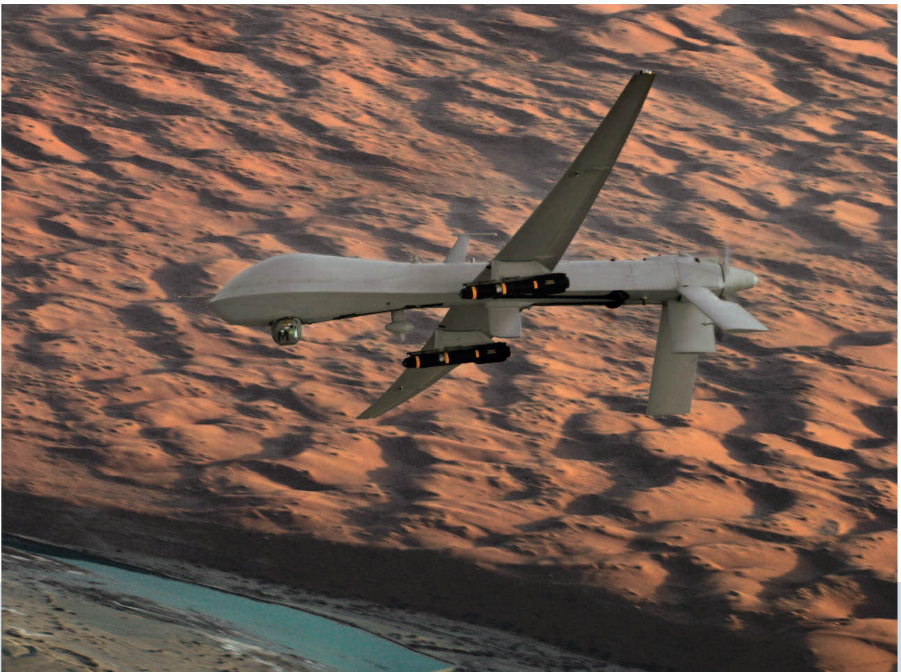
A MQ-1 Predator drone in flight over Afghanistan.

In 2018 the Remote Control Project will transition to become an ORG programme. Under the new brand of the Remote Warfare Programme, the team will sustain and expand its work on analysing the implications of changes in military engagement.