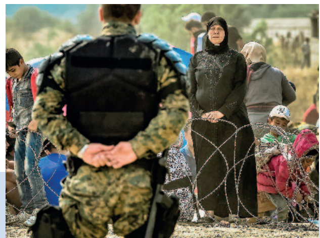
The migration crisis continued into 2016-2017. The Sustainable Security Programme has written several briefings examining the drivers behind and implications of this phenomenon.

Developed during 2017, the Sustainable Security Index is a pioneering new tool that quantifies the net impact on global security of 170 countries across the world. The SSP team has collated a wide range of data on issues including military expenditure, involvement in foreign conflicts, international aid contributions, greenhouse gas emissions, and human rights records. The index will help inform national governments about what they need to do or prioritise to become more responsible global actors. The aim is to help to shift national and international priorities by informing a global audience on what constitutes a sustainable approach to security and what practically states can do to move towards this. The Index is being piloted and refined towards a launch in the first half of 2018.