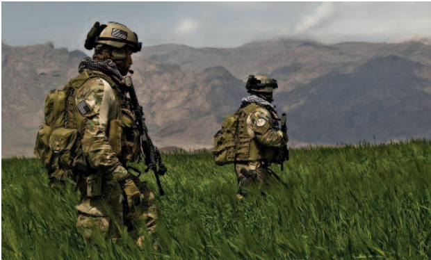
US Special Forces in Afghanistan.