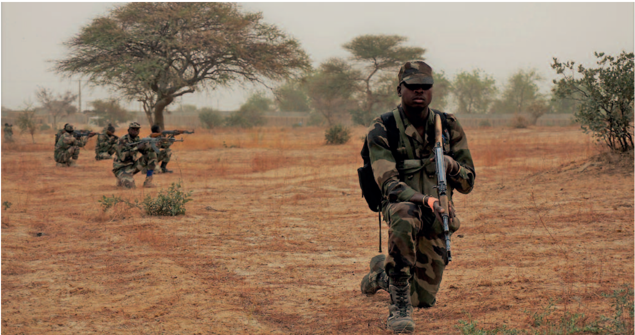
Much of Remote Control's recent research has attended to security cooperation, an integral part of Western states' use of remote warfare. The image depicts a Nigerian soldier on a US-led training exercise in Diffa, Niger.

Piloted in 2013 and continued as a project of the Network for Social Change hosted by ORG since 2014, the Remote Control Project has become a steadily more important strand of ORG's work, both as its expertise and influence have matured and as the relevance of its research on contemporary remote, or light-footprint, warfare has multiplied.