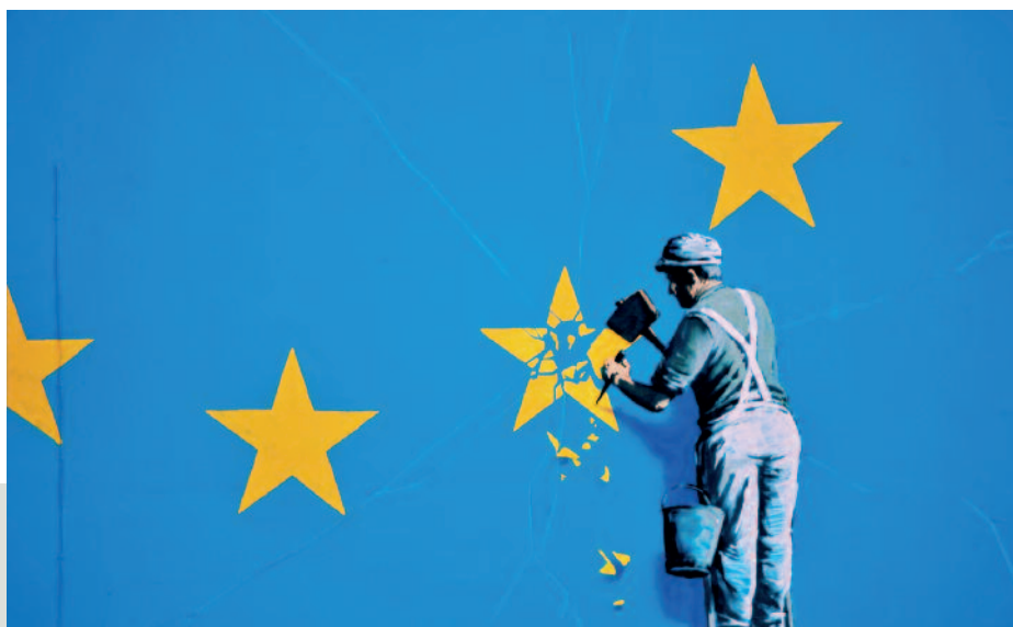
In a referendum on 23 June 2016, the UK electorate voted to leave the European Union. Since then, ORG has analysed the implications of this for Britain's defence and security. The image is of mural created by the artist Banksy in Dover. © Duncan Hill/Banksy.

The programmes also work to develop organisation-wide projects with input from all programmes.