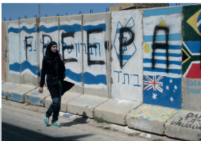
Hebron Wall.

ISF was established to create a new framework for collective strategic thinking in Israel across the Jewish political and social spectrum. Participants have ranged from secularists to the ultra-Orthodox and included peace activists, settlers, and those with links to the Israeli Defence Forces and parliament. In the past, the ISF held a series of fruitful discussions on internal social tensions within Israeli society. While we were not able to build on this discrete work in 2016, the group plays an integral role in our new cross-track project in Israel and Palestine.