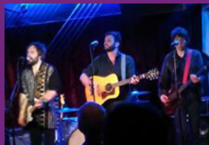
Greens will help protect music venues. Pictured: Orphan Colours performing recently at The Borderline.

The number of live music venues across London has dropped more than third in the past eight years alone.