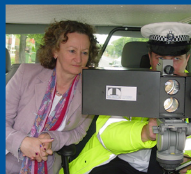
Jenny Jones AM in 2003 monitoring a police mobile safety camera initiative in Greenwich.

Green Assembly Member Jenny Jones has developed a fearsome reputation through her scrutiny of the Metropolitan Police Service.