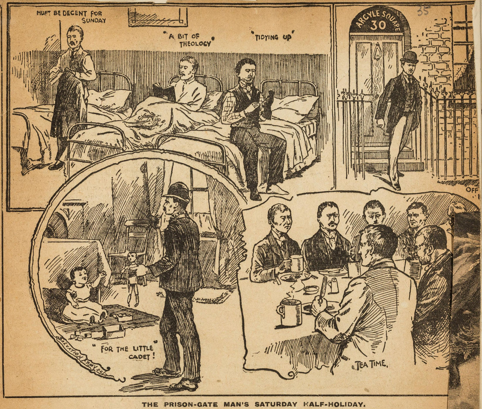
THE PRISON-GATE MAN'S SATURDAY HALF-HOLIDAY.

Army way makes the lazy work and gives the man who does want to help himself a fair chance. Ah, I had something the other night made my heart jump for joy! In our meeting (we've the best Social corps in the Work) two men got saved, and these two between them represent sixty-three years of imprisonment. Made me feel like dancing