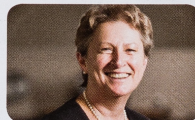
Gisela Stuart, Labour MP and Chair of Vote Leave

"The rights we have won for British workers came from our Parliament, not the EU. The EU is run in the interests of the big corporations who spend billions lobbying to make it work for them."