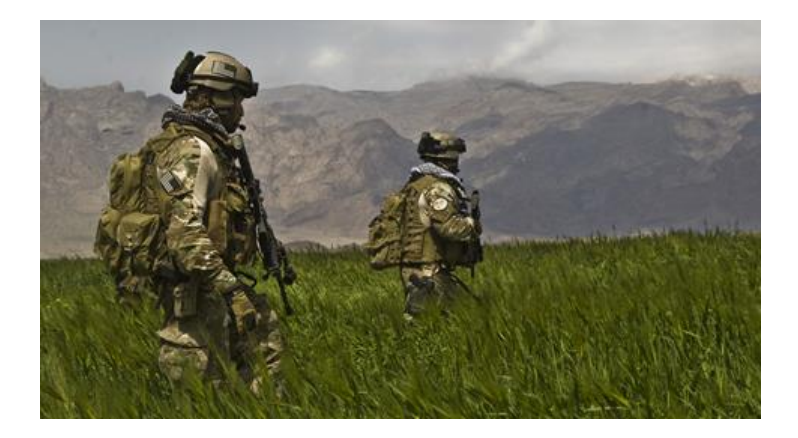
2002 Revisited: After the War, the War

The recent declaration of victory over Islamic State bares striking similarities to the situation in 2002 when the Taliban was seemingly vanquished and there was much misplaced optimism amongst Western states that the "Axis of Evil" states would be contained or replaced. This briefing looks back to that period in making a preliminary assessment of where we are 15 years on.