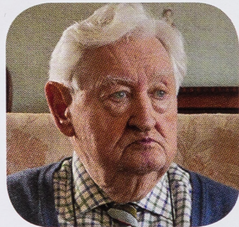
Field Marshal Lord Bramall, former Chief of the Defence Staff

"We would be going backwards, not forwards in what we set out to cure after the terrible tragedies of the Second World War."