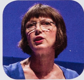
Frances O'Grady, TUC (Trades Union Congress) General Secretary

"Brexit would have massive implications for jobs, rights, and the very fabric of the UK. If you take that floor away, workers will be worse off."