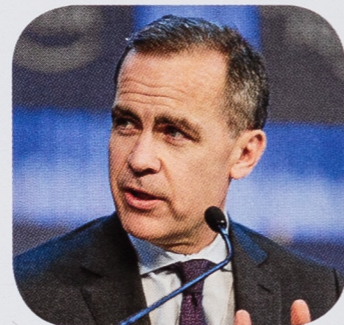
Mark Carney, Bank of England Governor,

"(Leaving the EU) is the biggest domestic risk to financial stability."