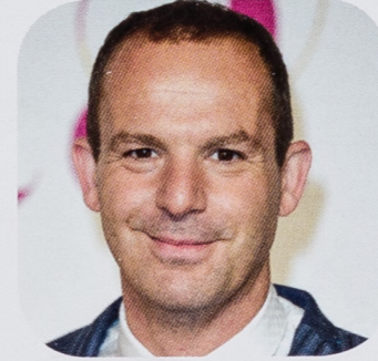
Martin Lewis, Consumer Champion

"I would say on balance of probability, it is more likely we'll have less money in our pockets if we vote to leave."