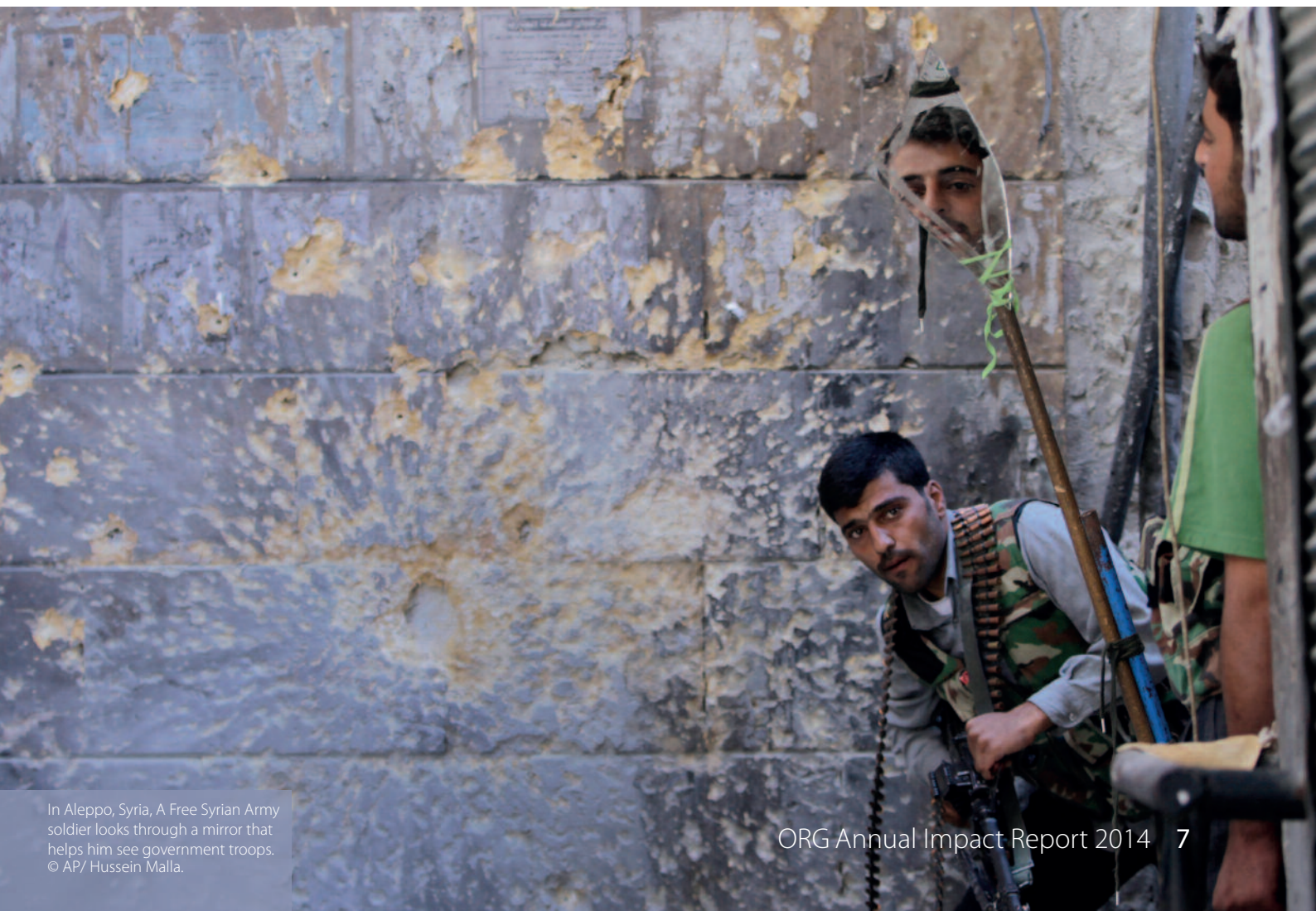
In Aleppo, Syria, A Free Syrian Army soldier looks through a mirror that helps him see government troops.

Starting in 2015, ORG and the RCSS will host a series of roundtables to consider conflict issues and to share the experiences and expertise of conflict resolution, mediation and dialogue of ORG as well as such international organisations as the United Nations, League of Arab States and the Commonwealth.