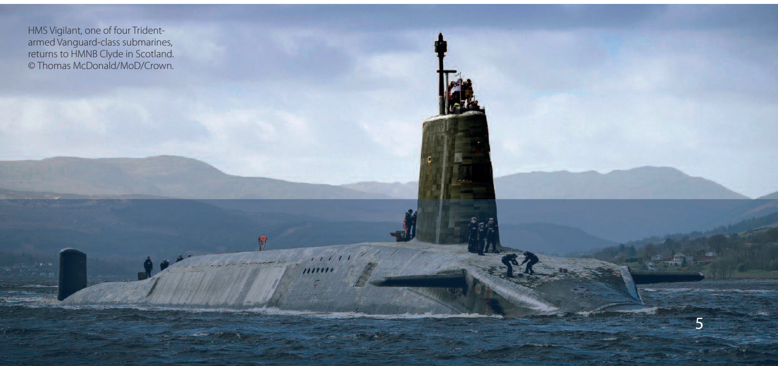
HMS Vigilant, one of four Trident-armed Vanguard-class submarines, returns to HMNB Clyde in Scotland.

During 2014 the blog added three new sub-projects to bring in new thinking on the nuclear weapons regime, security for women and girls, and 'Remote Control' warfare.