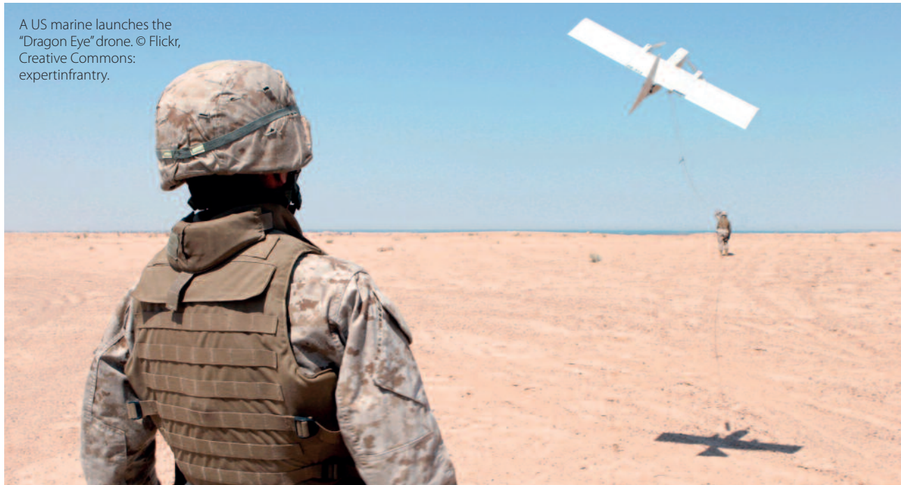
A US marine launches the "Dragon Eye" drone.

Remote Control is a project of the Network for Social Change hosted by ORG. Piloted in 2013, it was launched as a full scale research project in 2014. It looks at current developments in military technology and the re-thinking of military approaches to future threats.