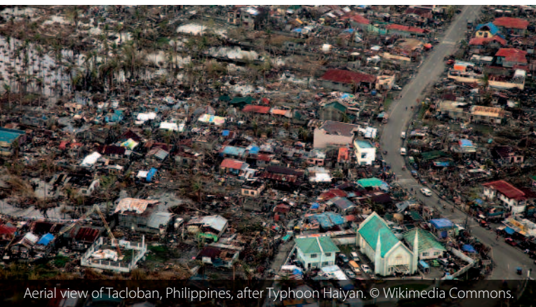
Aerial view of Tacloban, Philippines, after Typhoon Haiyan.

The central premise of ORG's pioneering sustainable security approach is that we cannot successfully control all the consequences of insecurity, but must work to resolve the underlying causes. In other words, fighting the symptoms will not work; we must instead cure the disease.