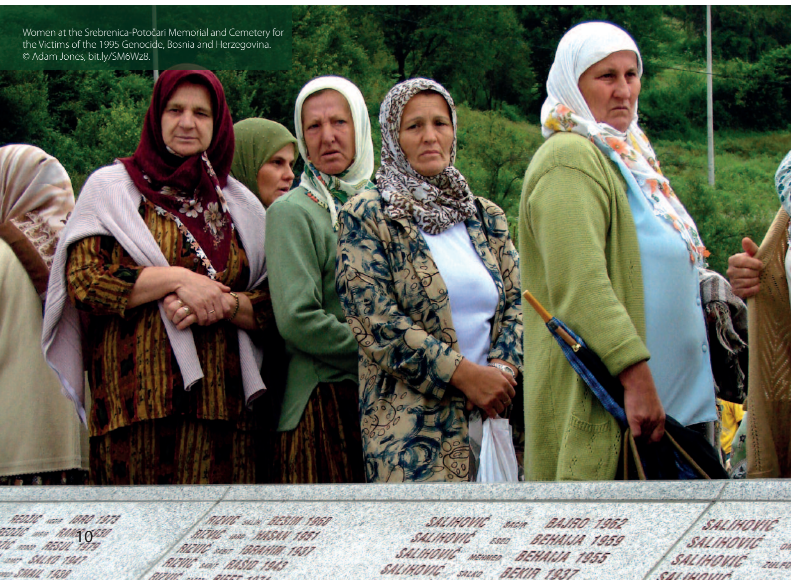
Women at the Srebrenica-Potočari Memorial and Cemetery for the Victims of the 1995 Genocide, Bosnia and Herzegovina.

Every Casualty Worldwide continues this work in 2015. More on its work can be found on its website: http://www.everycasualty.org