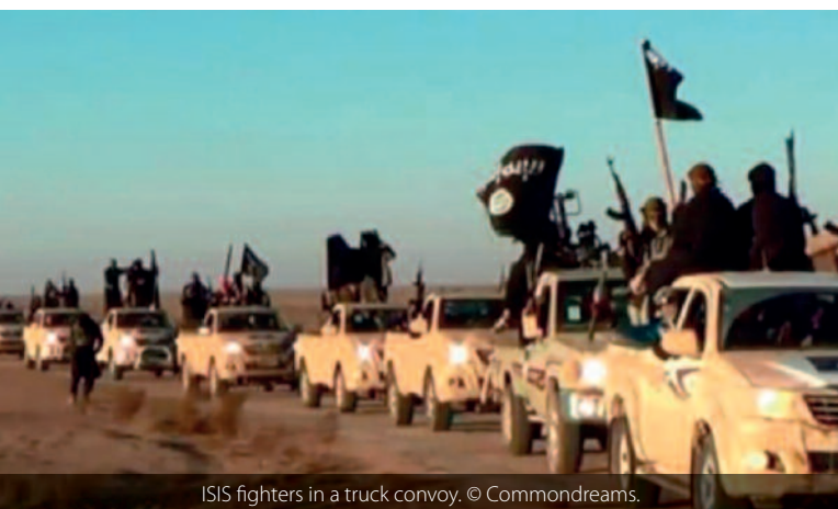
ISIS fighters in a truck convoy.

ORG's Middle East Programme facilitates inclusive dialogue, often engaging with groups who sit outside official diplomatic processes, to explore support for the end of conflict. Our work takes realpolitik and the competing forces present in any political process into account.