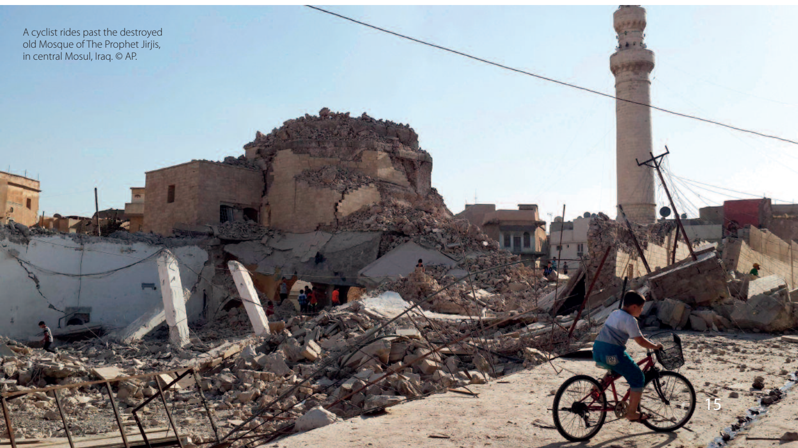
A cyclist rides past the destroyed old Mosque of The Prophet Jirjis, in central Mosul, Iraq.