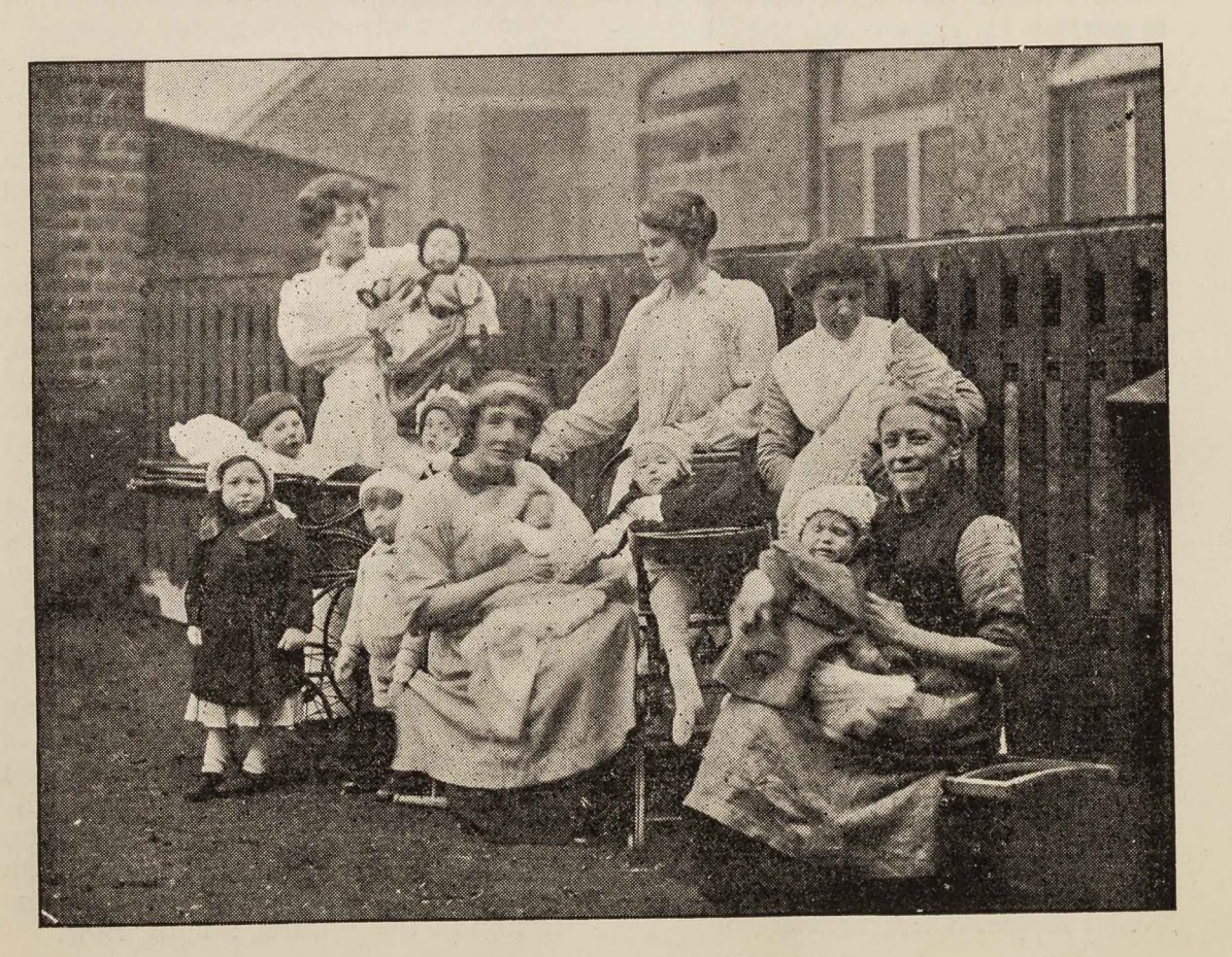
IN THE NORMAN ROAD NURSERY.