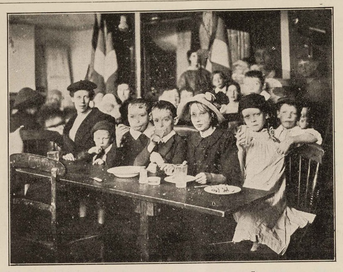
OUR POPLAR RESTAURANT, 20 RAILWAY STREET.