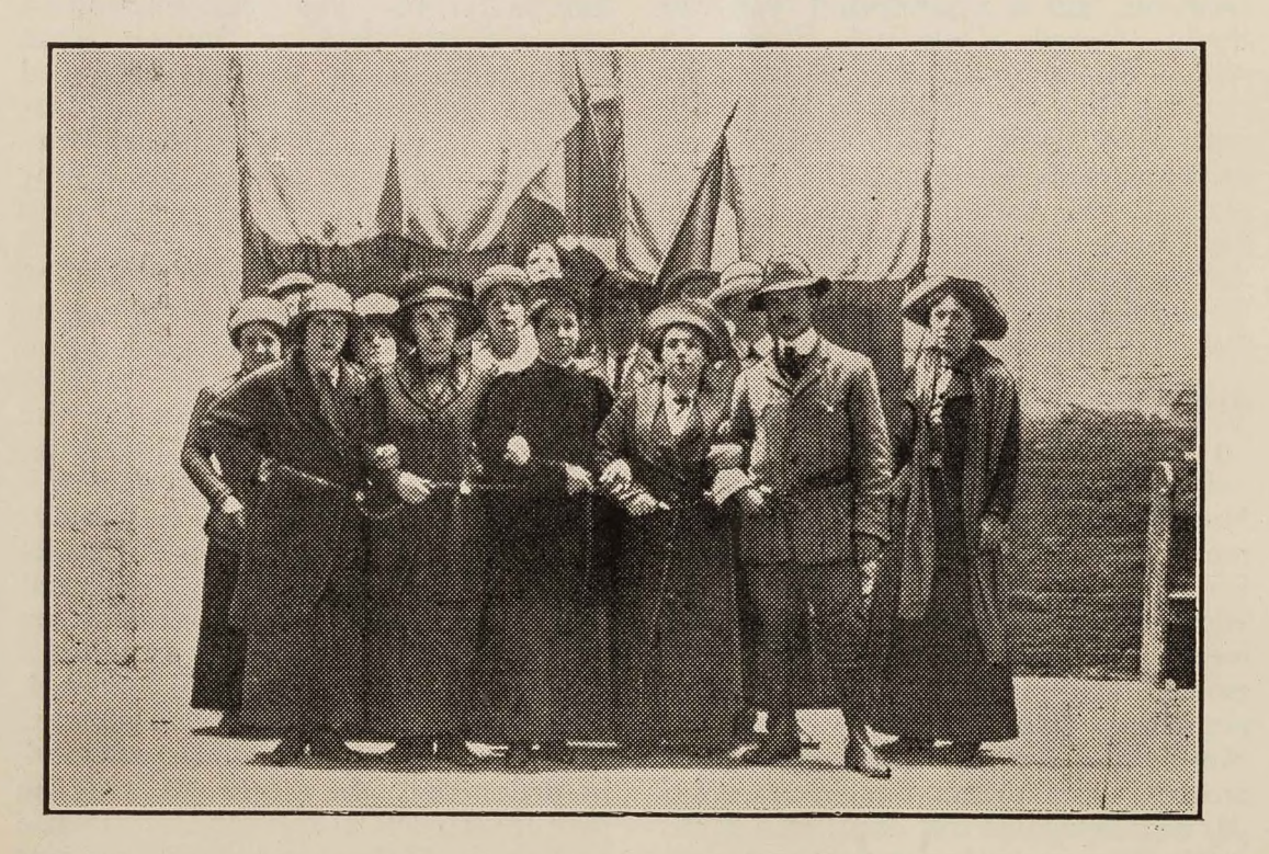
THE CHAINED GUARD, May 23rd, 1914.