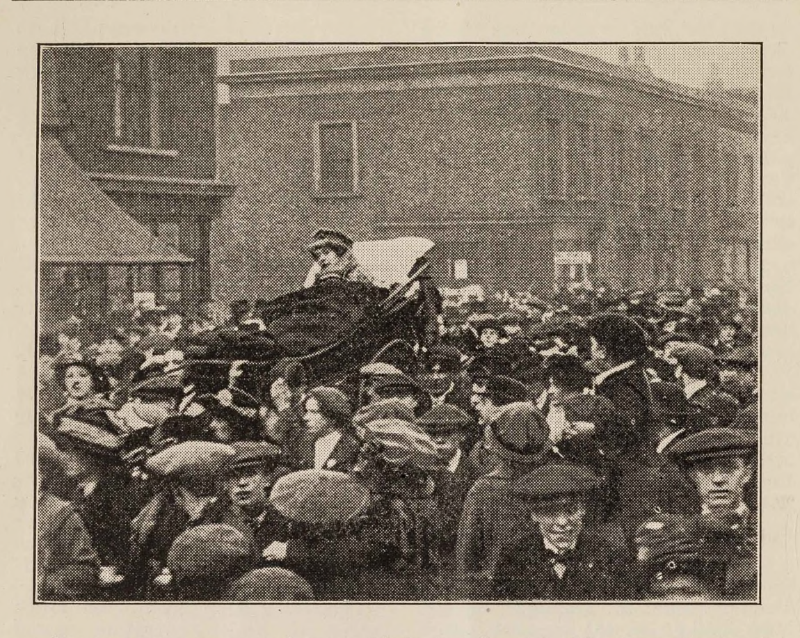
ON THE WAY TO THE ABBEY, Mothering Sunday, March 22nd, 1914.