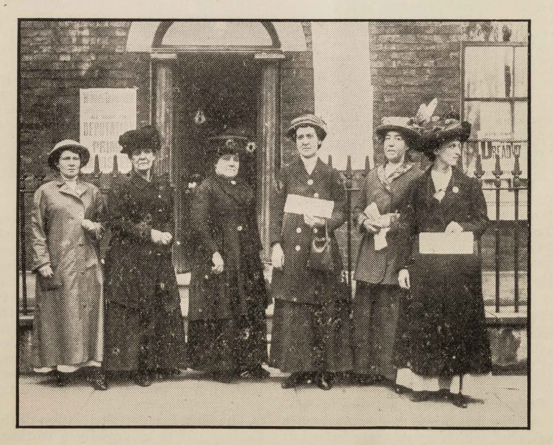
THE DEPUTATION TO THE PRIME MINISTER.