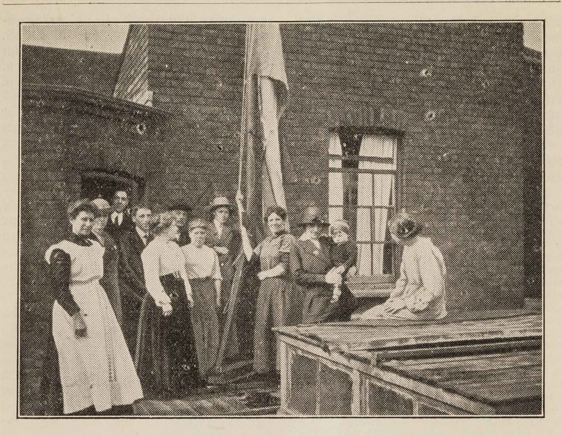
GETTING READY FOR ACTION.