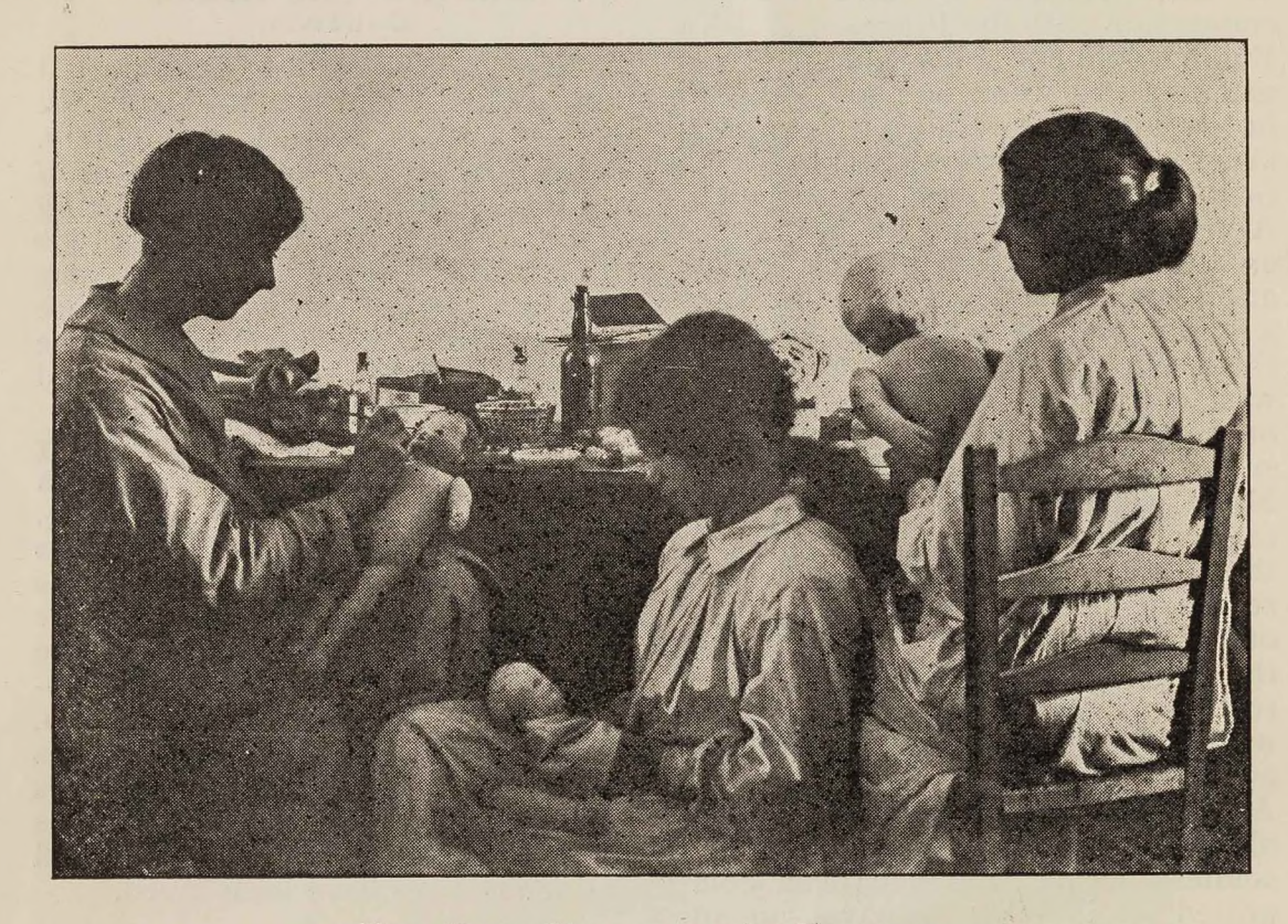
THE DOLL ROOM OF THE FACTORY.

We have opened a day nursery at 45 Norman Road, Bow, in connection