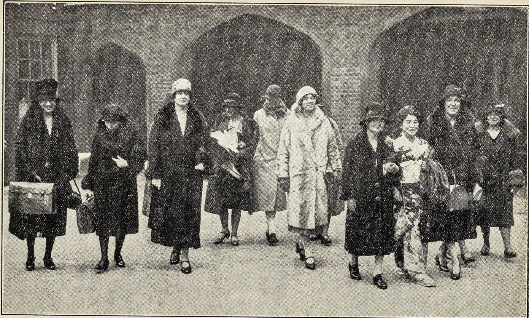
Some of the Deputation in the Court Yard of St. James's Palace.