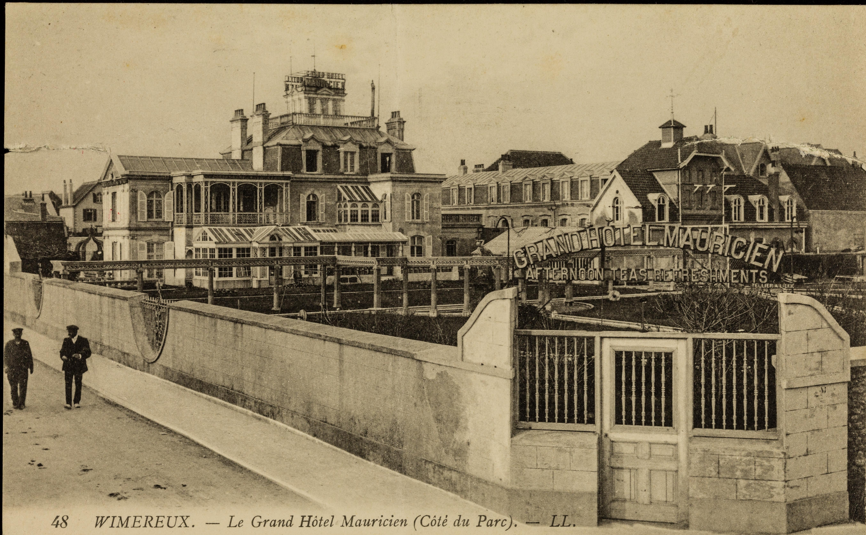
48 WIMEREUX. — Le Grand Hôtel Mauricien (Côté du Parc). — LL.