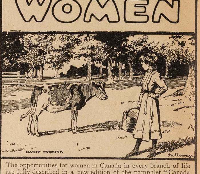
are fully described in a new edition of the pamphlet "Canada for Woman," issued by the Canadian Pacific Railway. Write to-day for a copy, which will gladly be sent post free.

Canadian Pacific Railway. 62-65, CHARING CROSS, LONDON, S.W.