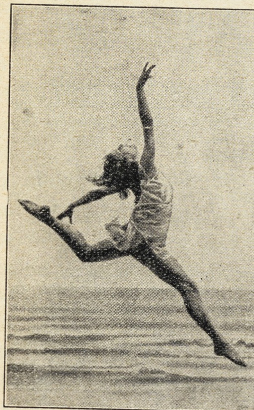
Movement is Life (Regd.).